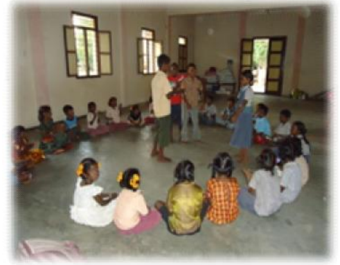
Supplementary Education Centre at Sambuvelli