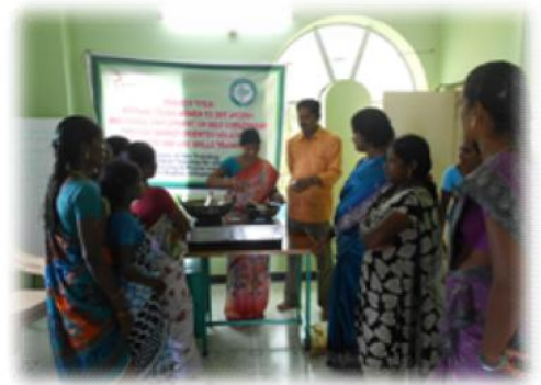
Training on Food Preparation and Preservation