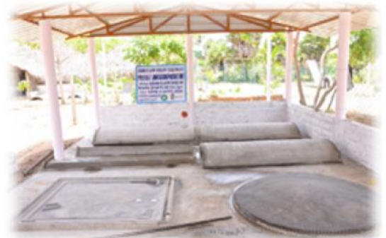
Ready - Made Modular Toilet Production Unit