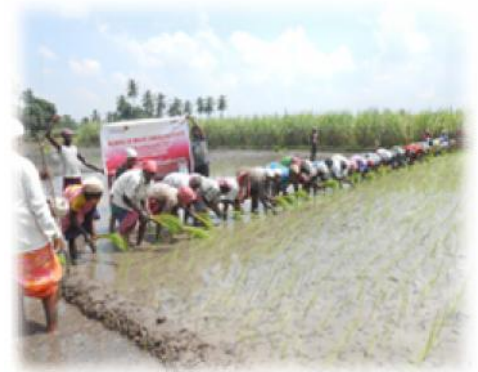
Filed School Training on SRI Method Paddy Cultivation