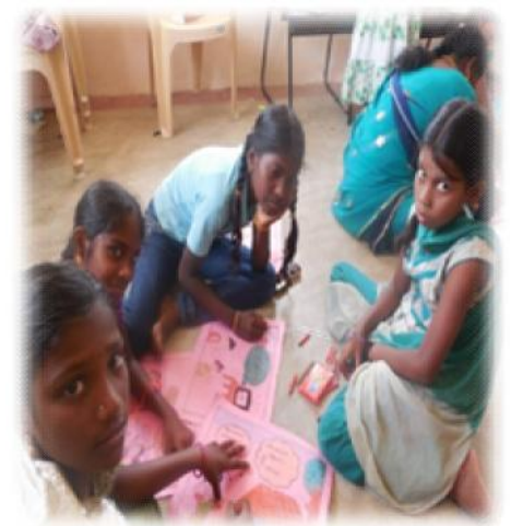
Children at Child Activity Centre, Mailam block