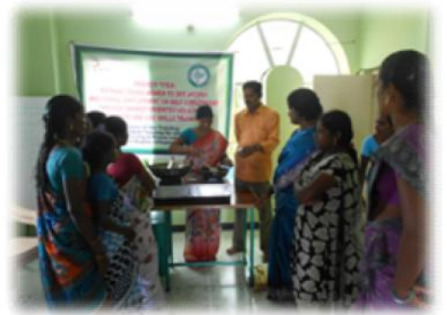
Training on Food Preparation and Preservation