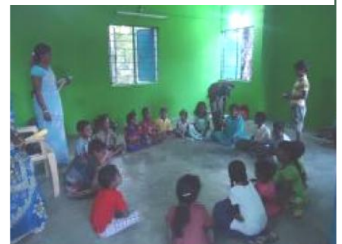
Figure 1 children attending SERC class