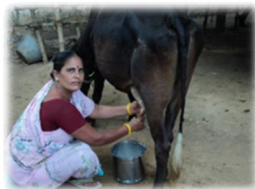
Milch Animal Beneficiary at Kattumannarkoil