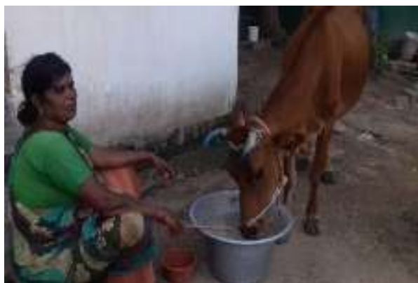
REAL Training Centre

Our well furnished residential training centre at Koonimedu hosts residential training programmes supported by DRDA, Cuddalore, Villupuram, and Pondicherry on social audit and governance to Government Office Bearers at present. Also, private organizations like FSL and CARE India utilize our centre for operational training in our centre. Exposure visits were also undertaken and NAVADOYA Team had visited our centre and learned about the major activities implemented at this centre. During this year the Centre catered to the needs of around